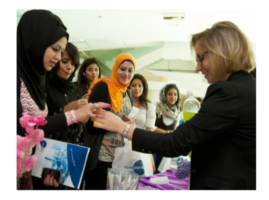
Sciences Career Fair